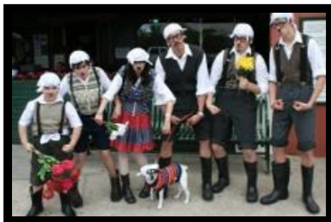
Wouldn't you like to have this lot of Gumbys over for tea?