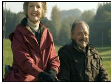
Keith and deVere reprise roles in special

Penelope Keith and Peter Bowles returned to our screens as the aristocratic Audrey fforbes-Hamilton and the dashing, self-made businessman Richard DeVere, for a one-off special of the classic British comedy To The Manor Born .