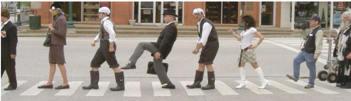
Python Players' Version of Abbey Road