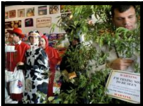
And yes, a costume contest