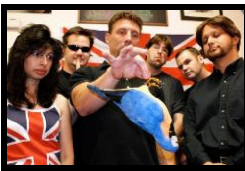
This! Is an EX-parrot say The Players