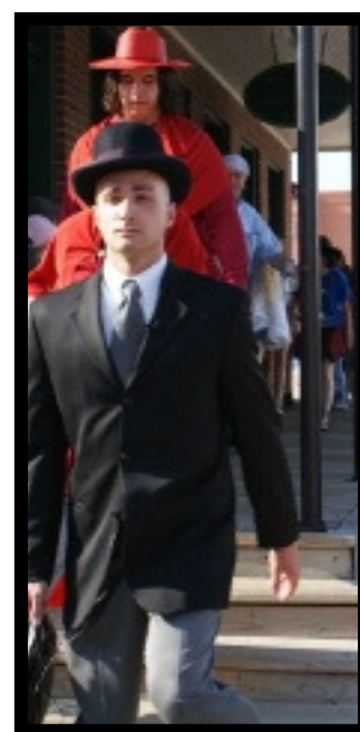
Silly walkies Minister?